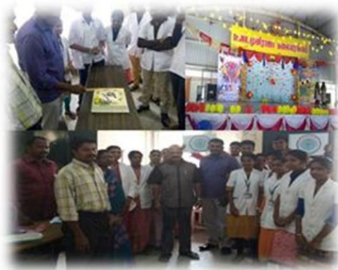
RMMC- OT& JKKMMRF-OT

54. As one of the event in the OT month (Oct'27th-Nov'26th) TNAIOTA in collaboration with BLOSSOM KIDZ CLINIC celebrated WORLD OCCUPATIONAL THERAPY DAY, 2017 on Children's Day, 14th Nov at 5.00pm. Also the 9th anniversary of the clinic was celebrated.